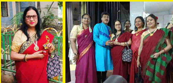
"Rabindra Jayanti" At Jadabpur University auditorium. Sur O Bina