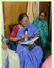
SAYANHE - A project Mental support to old people, It is a continuous project for the last two years