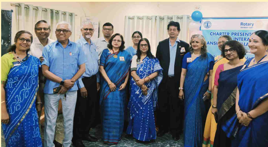
Interact Charter Handover Ceremony at Mansur Habibullah Memorial School