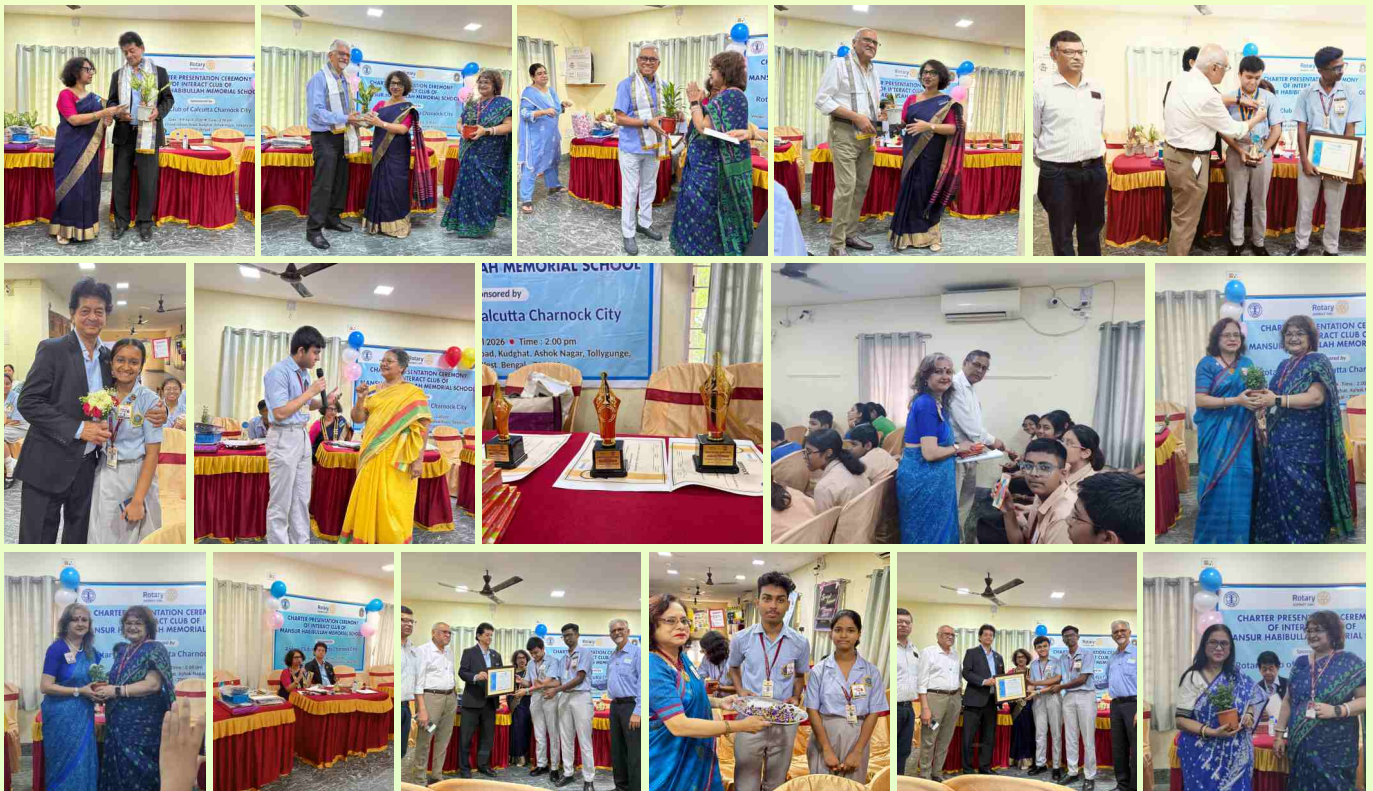
Photos of 548 th Regular Meeting of RC Calcutta Charnock City on 9 th April 2026, at Mansur Habibullah Memorial School and Interact Charter Handover Ceremony