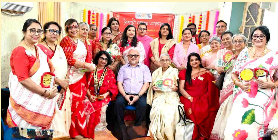
Joint Meeting on Baishakhi Sandhya