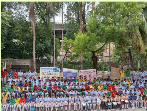
► FOGSI, BOGS, Rotary Club of Calcutta Charnock City along with the Interact Club of MHMS will be observing the World Immunization week and 27th April at 8 am at Mansur Habibullah Memorial School.