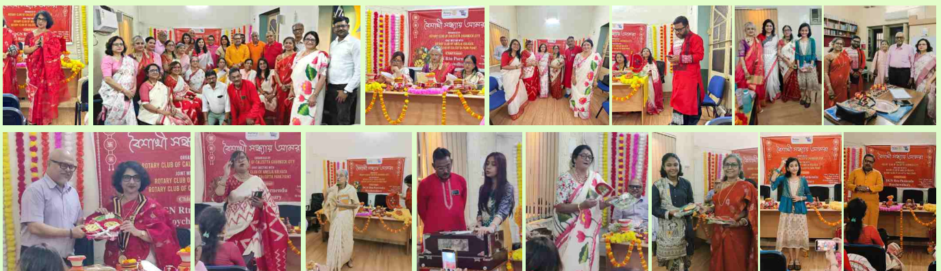
Photos of the 549 th Regular Meeting of RC Calcutta Charnock City, Joint Meeting with RC AMELIA Kolkata 78 th Regular Meeting, RCC Park Point-1119 th RM and Barsho Boron on 17 th April 2026, at COMMUNE, ELGIN ROAD ,6 PM.