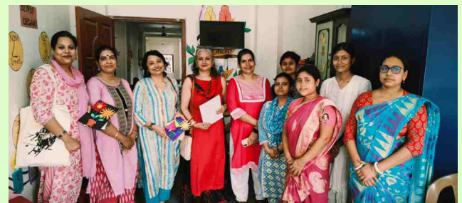
Vocational training centre at Joka