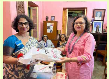
Fourth Board Meeting on 6th May