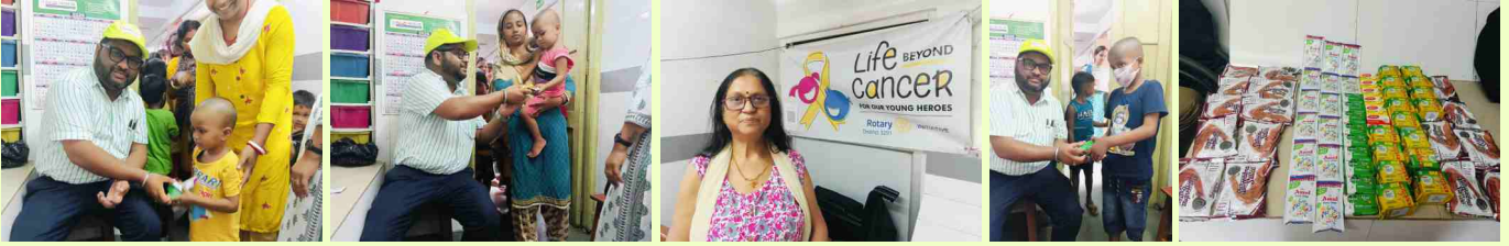
MONTHLY PROJECT AT SSSKM on 21st April, It is a continuous project for last five years